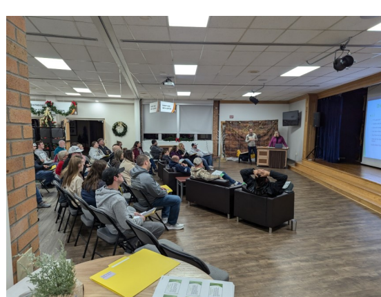
UPWARD COACH MEETING