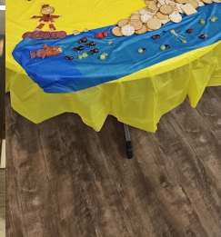
PRAISE KIDS "JINGLE BELL BEACH"