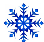
FSM CHRISTMAS PARTY