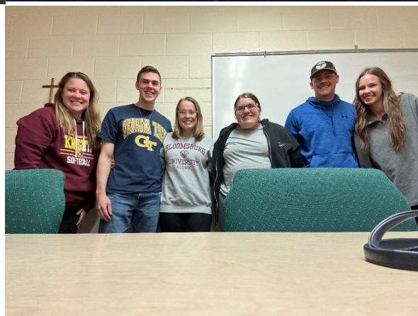
YOUNG ADULT GROUP