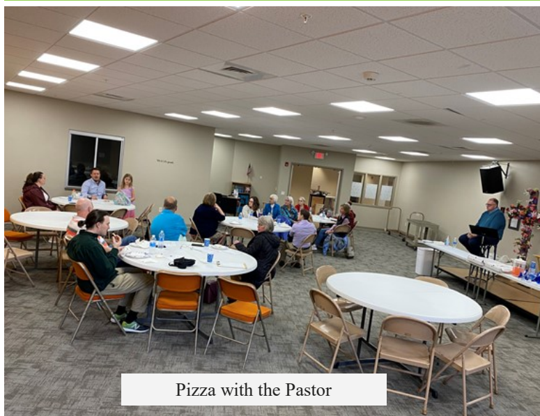
Pizza with the Pastor