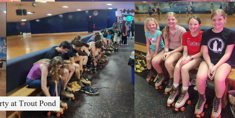
FSM Skating Party at Trout Pond