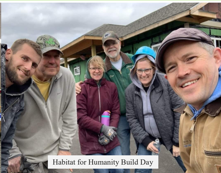
Habitat for Humanity Build Day