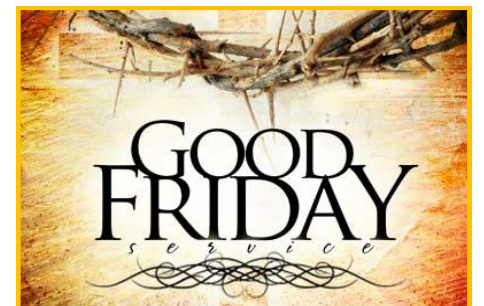
April 14 at 7:00 pm Witnesses at the Cross

Sermons after Easter April 22-23 - Back to Normal? April 29-30 - The Other Lord's Prayer