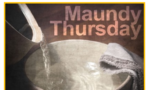
April 13 at 7:00 pm What's in the Box?