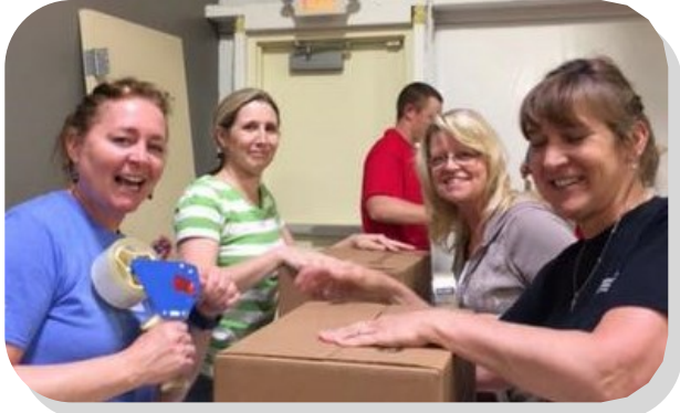
Packing Food Boxes for Senior Citizens at the Central PA Food Bank