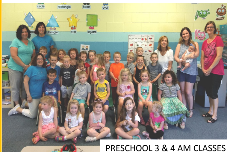
PRESCHOOL 3 & 4 AM CLASSES