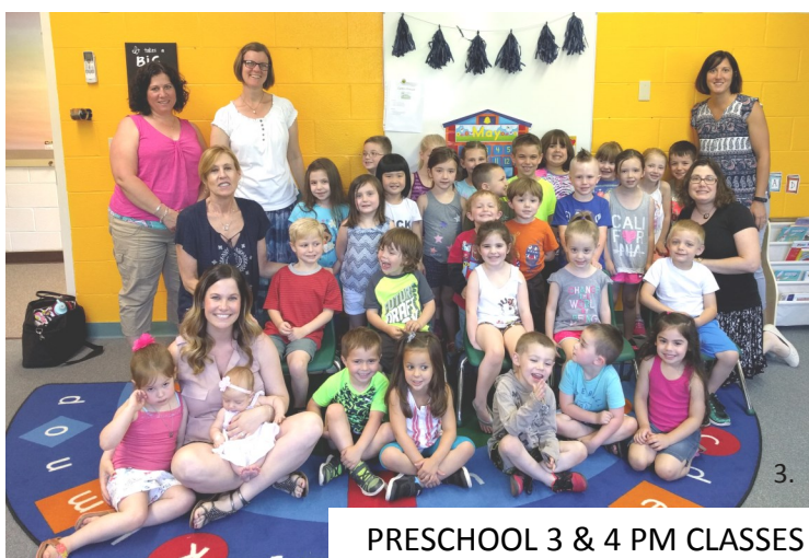
PRESCHOOL 3 & 4 PM CLASSES