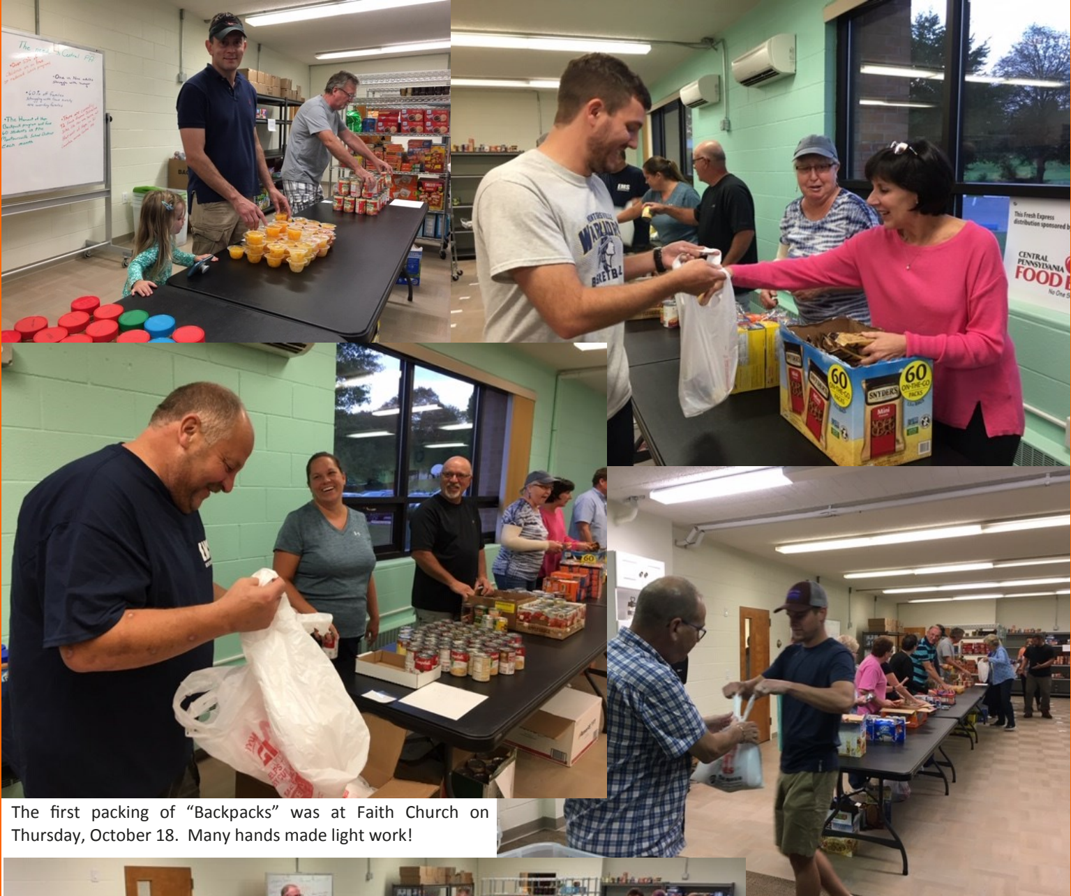
The first packing of “Backpacks” was at Faith Church on Thursday, October 18. Many hands made light work!

There aren't enough words to describe the reception of the Backpack Program in our local school districts. A critical need for food has been met and we have discovered that the need is great. Our backpack program currently supplies weekend food to students in each of the 4 schools in the Montoursville area school district. We have discovered that the need in our elementary schools is particularly great and so we have decided to increase our food by 20 backpacks beginning this month. To do this, we need your help. Faith UMC was not assigned a particular food category for precisely this reason as we anticipated needs that would require an immediate response to supply the food for the 20 additional backpacks. Thank you in advance for your donation of any food on the lists supplied in the Narthex . It is important that donations stick to the exact requested size and item so that all backpack food remains the same for each student. Items can be placed in the wooden bins in the Narthex labeled 'Harvest of Hope'.