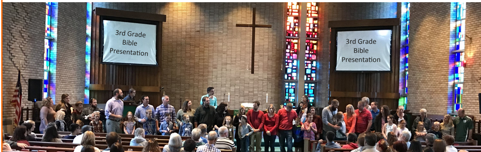
UNAFRAID - SHORT TERM COMMUNITY GROUPS