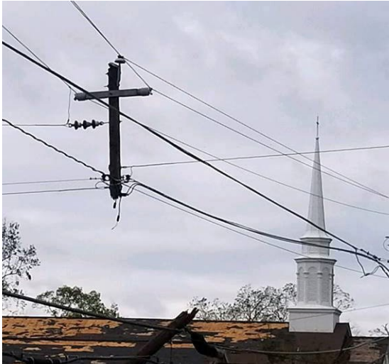
A utility pole destroyed by Hurricane Michael is left in the shape of a cross in front of Colquitt (Ga.) United Methodist Church.

[This is an excerpt of an article from United Methodist News Service – for the full article or to subscribe to regular news from our connection of United Methodist Churches go to www.umnews.org .]