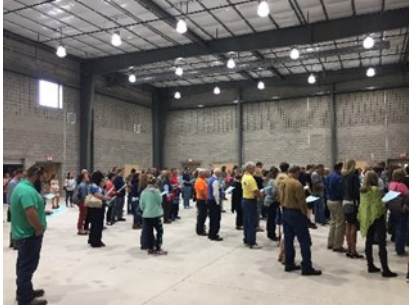
Blessings of Faith Community Center on Sunday, September 23, 2018.