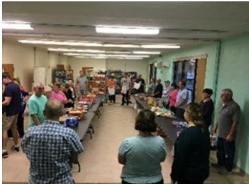
First Backpack Program packing event was on September 20, 2018.